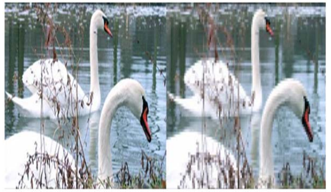
Fig. 1: Compression of an Image

Compression of the data is worthy because the data which is uncompressed such as audio, video and graphics requires large transmission bandwidth and storage capacity. Image compression is also a type of compression technique which is used to reduce the size of graphics in terms of bytes to inhibit an acceptable quality of an image. [1] Due to compression, the file size gets minimized at its best so that a number of images can be reserved in an available memory space or disk. Moreover, a very less time is needed to transmit the images over the internet.